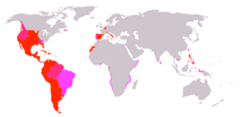
Map that shows those territories that belonged to Spain and Portugal during the Age of Exploration.

During the fifteenth and the sixteenth century the states of Europe began their modern exploration of the world with a series of sea voyages. The Atlantic states of Spain and Portugal were foremost in this enterprise though other countries, notably England and the Netherlands, also took part.