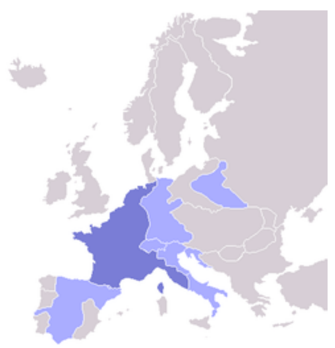
Napoleonic Empire, 1811: France in dark blue, satellite states in light blue

In 1804 Napoleon declared himself French Emperor and became a military dictator. Napoleon was undefeated against his three main continental enemies, defeating Austria, Russia, and Prussia multiple